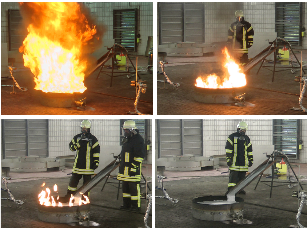
Fig. 1: Successful suppression experiment (Foam slide in the background; heat flux sensors on the left and right.).

The available amounts of the new carbohydrate siloxane surfactants are very limited, since these have only been synthesized in a laboratory scale, yet. Mainly for this reason the fire tests reported here were not conducted on the basis of international standards such as EN 1569 or ICAO. Rather, the fire tests were set up as outlined in the Materials and Methods section and as described in the following and in Figure 1. The foam was gently applied over a ramp (0.54 m high, 1.65 m long, 0.15 m wide) onto the surface of the fuel with a very low application rate of 1.5 kg/(min×m 2 ). This procedure should avoid any pressure or directing effects but emphasize the effect of the water film and the high performance of AFFF during the extinguishing tests [13]. Moreover, we selected this experimental setup, because it allows a high degree of reproducibility.