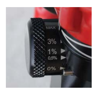
Multiple Proportioning Settings (75 liter model shown)