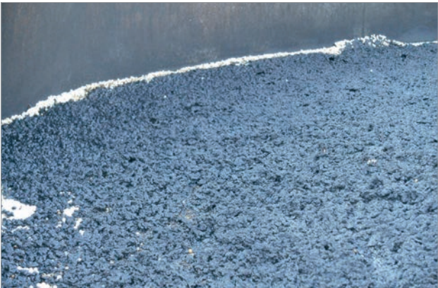
DryFoam™ post event