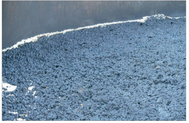
DryFoam™ post event